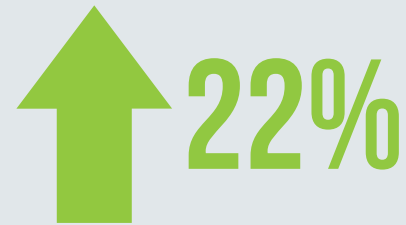
From 2011 to 2021, Maine's FDI employment...

while the state's overall private-sector employment