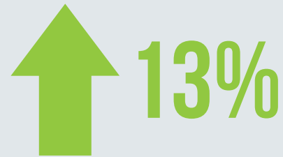
From 2011 to 2021, Maryland's FDI employment...

while the state's overall private-sector employment