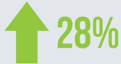
From 2016 to 2021, Missouri's FDI employment...

while the state's overall private-sector employment remained