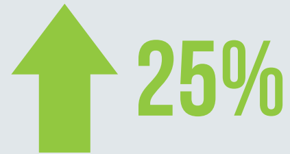
From 2016 to 2021, Nevada's FDI employment...

while the state's overall private-sector employment