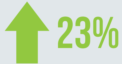
From 2011 to 2021, New York's FDI employment...

while the state's overall private-sector employment