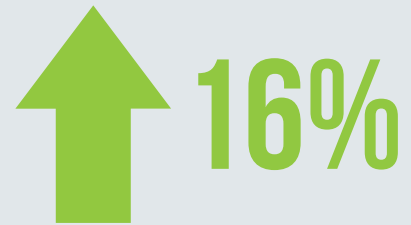
From 2016 to 2021, South Dakota's FDI employment...

while the state's overall private-sector employment