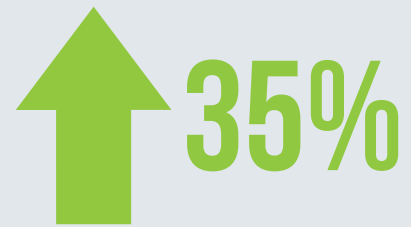
From 2016 to 2021, Vermont's FDI employment...

while the state's overall private-sector employment