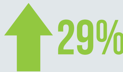
From 2011 to 2021, Virginia's FDI employment...

while the state's overall private-sector employment