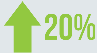
From 2016 to 2021, Washington's FDI employment...

while the state's overall private-sector employment