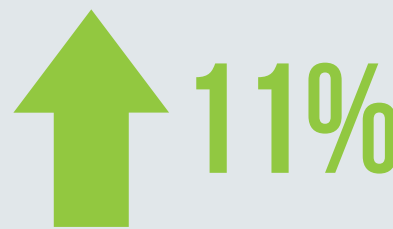
From 2017 to 2022, Alabama's FDI employment...

while the state's overall private-sector employment