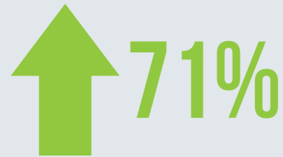
From 2012 to 2022, Arizona's FDI employment...

while the state's overall private-sector employment