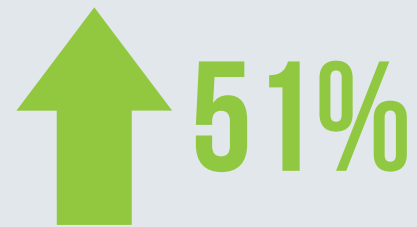
From 2012 to 2022, Colorado's FDI employment...

while the state's overall private-sector employment