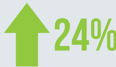
From 2017 to 2022, Florida's FDI employment...

while the state's overall private-sector employment