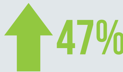
From 2012 to 2022, Georgia's FDI employment...

while the state's overall private-sector employment