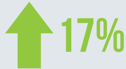
From 2017 to 2022, Kansas' FDI employment...

while the state's overall private-sector employment