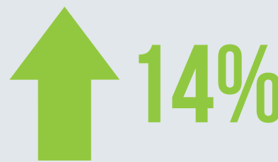
From 2017 to 2022, Michigan's FDI employment...

while the state's overall private-sector employment