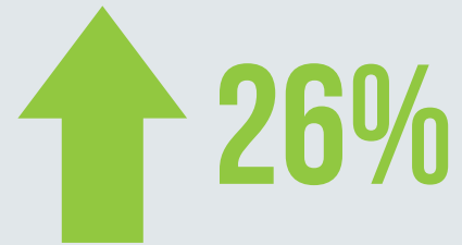
From 2017 to 2022, Mississippi's FDI employment...

while the state's overall private-sector employment