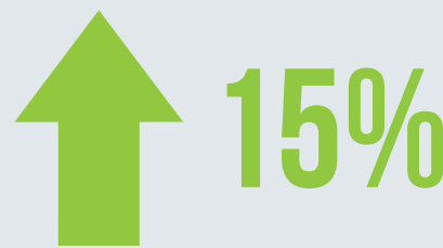
From 2017 to 2022, Nebraska's FDI employment...

while the state's overall private-sector employment