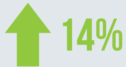
From 2017 to 2022, New Hampshire's FDI employment...

while the state's overall private-sector employment