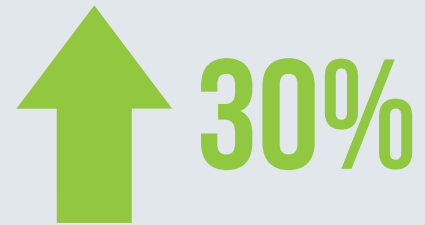
From 2012 to 2022, New Jersey's FDI employment...

while the state's overall private-sector employment