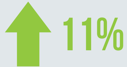
From 2017 to 2022, New Mexico's FDI employment...

while the state's overall private-sector employment