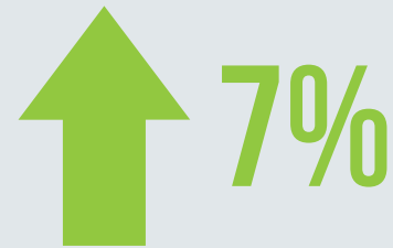
From 2017 to 2022, New York's FDI employment...

while the state's overall private-sector employment remained