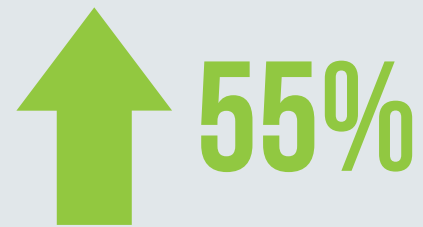
From 2012 to 2022, North Carolina's FDI employment...

while the state's overall private-sector employment