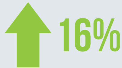
From 2017 to 2022, Oklahoma's FDI employment...

while the state's overall private-sector employment