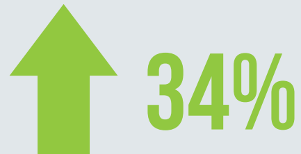
From 2012 to 2022, South Dakota's FDI employment...

while the state's overall private-sector employment