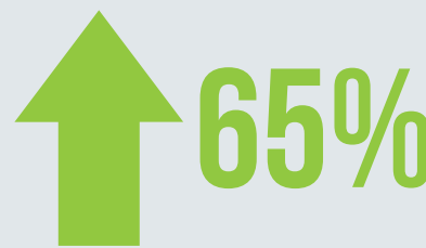
From 2012 to 2022, Tennessee's FDI employment...

while the state's overall private-sector employment