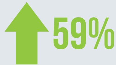
From 2012 to 2022, Utah's FDI employment...

while the state's overall private-sector employment