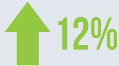
From 2017 to 2022, Wisconsin's FDI employment...

while the state's overall private-sector employment