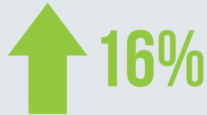
From 2018 to 2023, Alabama's FDI employment...

while the state's overall private-sector employment