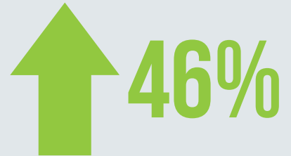
From 2018 to 2023, Delaware FDI employment...