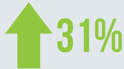
From 2013 to 2023, Illinois' FDI employment...

while the state's overall private-sector employment