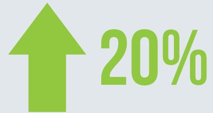
From 2018 to 2023, Mississippi's FDI employment...

while the state's overall private-sector employment