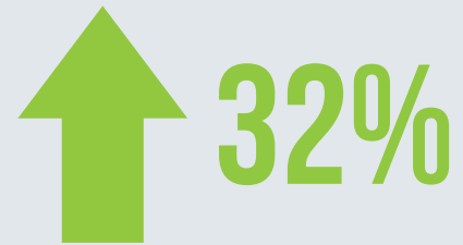
From 2018 to 2023, Nevada's FDI employment...

while the state's overall private-sector employment