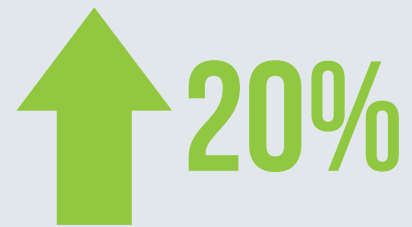
From 2018 to 2023, South Carolina's FDI employment...

while the state's overall private-sector employment