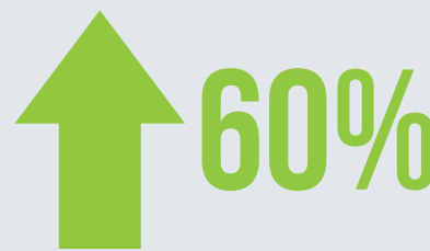
From 2013 to 2023, Tennessee's FDI employment...

while the state's overall private-sector employment