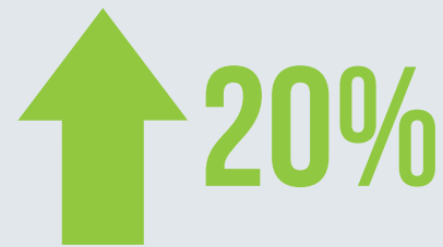
From 2018 to 2023, Utah's FDI employment...

while the state's overall private-sector employment